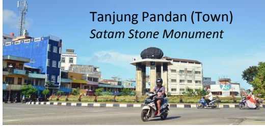
Tanjung Pandan (Town) Satam Stone Monument