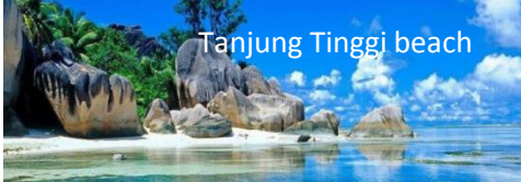
Tanjung Tinggi beach