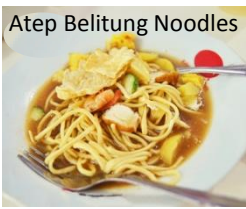
Atepe Belitung Noodles