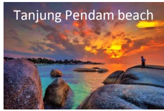
Tanjung Pendam beach